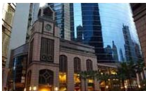
📍 HONG KONG